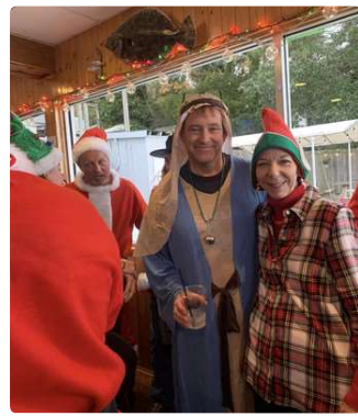
Starting at Dockside